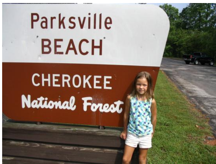
Conservation really is for the kids!