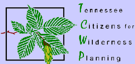
Tennessee Citizens for Wilderness Planning

At our November 9 meeting, Chota membership will vote on whether to approve making $1,000 donations to each.