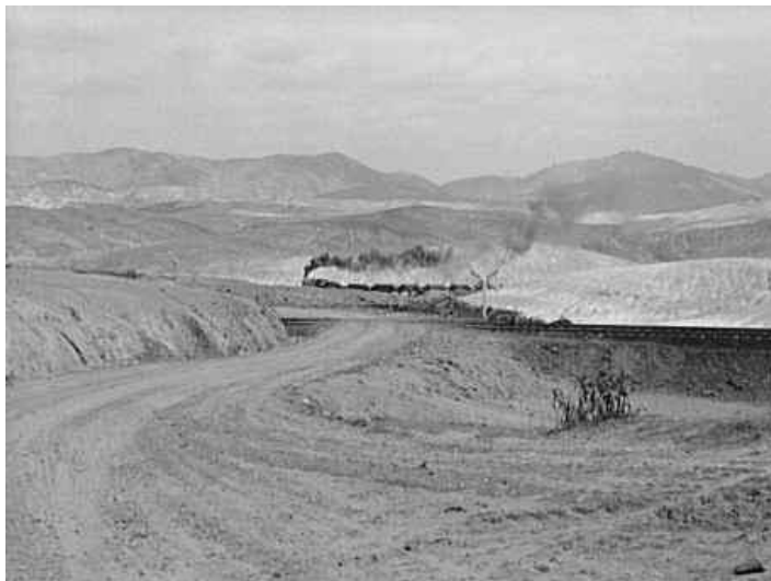
Train in desolate Copper Basin area, c. 1930

Over 50 square miles became a deforested, barren, eroding landscape that resembled the moon. Astronauts once used the denuded Copper Basin as a landmark that was visible from space. Mining and smelting operations devastated the Ocoee River. Massive amounts of eroded soil partially filled the stream beds and three reservoirs on the Ocoee River. Acid and metals leached from deep mines and spoil piles. Parts of the Ocoee River were devoid of fish and most forms of aquatic life for decades.